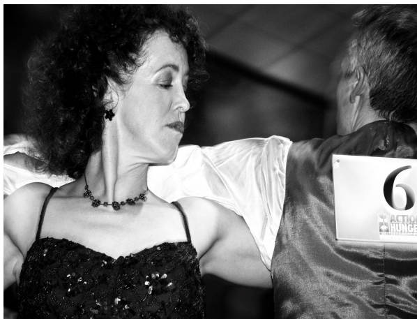
Smouldering or just grumpy? You decide.