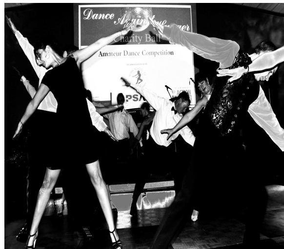
The Tango group in action...